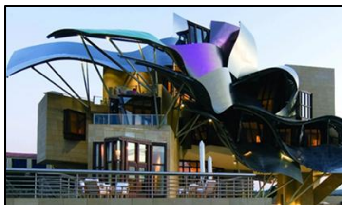
FIGURE G: Marqués de Riscal Hotel and Winery complex by Frank Gehry (Spain), 2006.