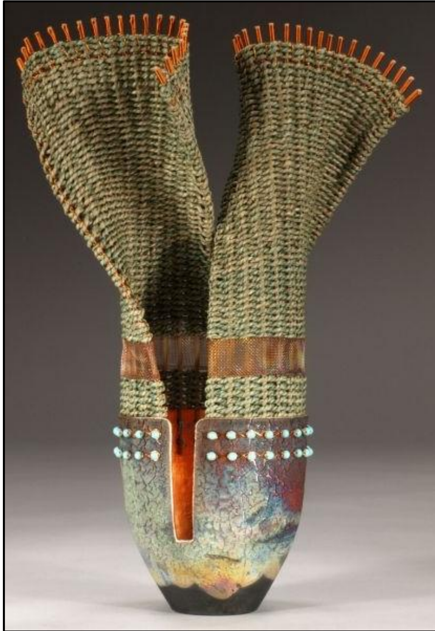
FIGURE B: Raku-fired ceramic and basketry vessel by Willow Bend Studio designers Marc Jenesel and Karen Pierce (USA), 2018.

1.2.1 Analyse the design in FIGURE B above by referring to the following: