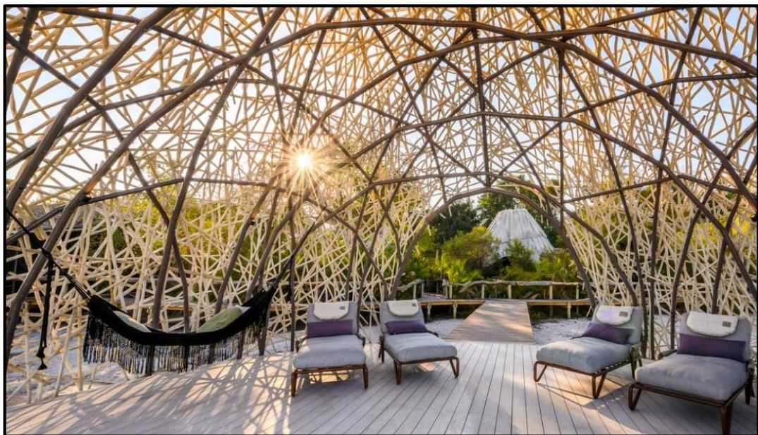
FIGURE K: Bird's Nest pool gazebo (an outdoor structure that offers shade from the sun and can be used for outdoor entertaining), Jao Camp Okavango Delta Lodge (Botswana), 2022.