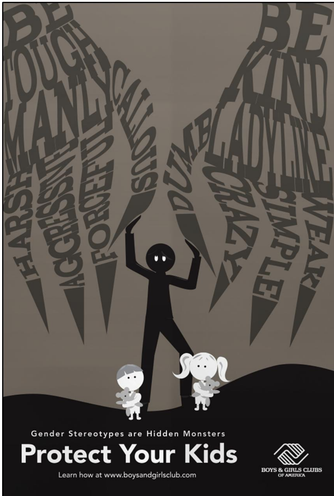
FIGURE C: Gender stereotype campaign poster by Lindsay Helms (USA), 2017.

Explain how imagery and text is used to convey the message of gender stereotyping in FIGURE C above.