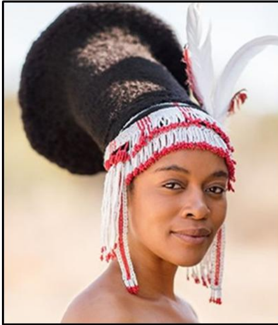
FIGURE D: Traditional amaZulu hairstyle (South Africa), 2022.