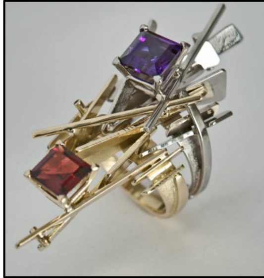
FIGURE H: Deconstructivism ring by Anneke Schat (The Netherlands), circa 2015.