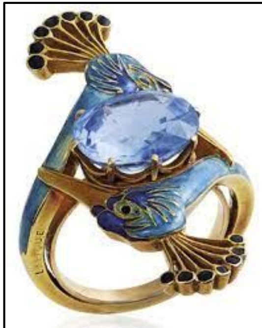
FIGURE I: Art Nouveau ring by René Lalique (France), circa 1900.

Write an essay (at least ONE page) in which you compare the rings in FIGURE H and FIGURE I above and explain how they are typical of the movements they represent.