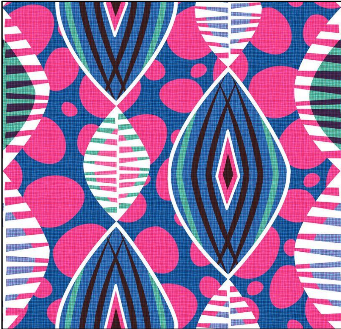
FIGURE A: Textile design in honour of Black History Month by Spoonflower (USA), 2020.

1.1.1 Analyse the use of the following elements and principle in FIGURE A above: