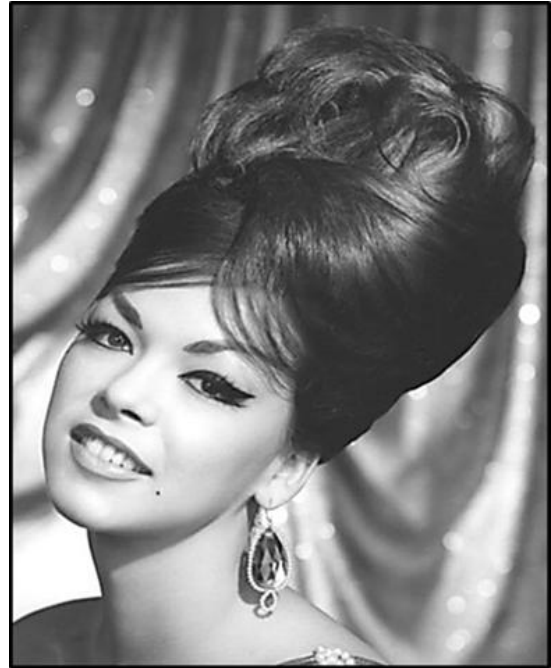
FIGURE E: Fashionable beehive hairstyle (USA), 1960s.

Write a paragraph in which you compare the hairstyle designs in FIGURE D and FIGURE E with reference to the following: