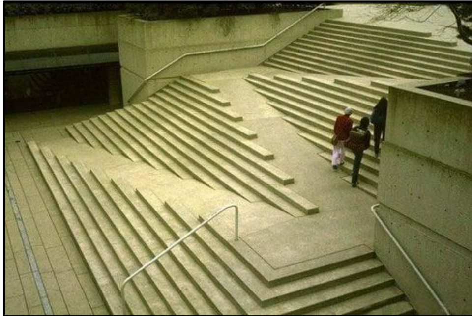
FIGURE J: Rockson Square staircase by Arthur Erickson Architects (Canada), 1983.

5.1.1 Discuss TWO positive and TWO negative functional design features of the staircase in FIGURE J above. (4)