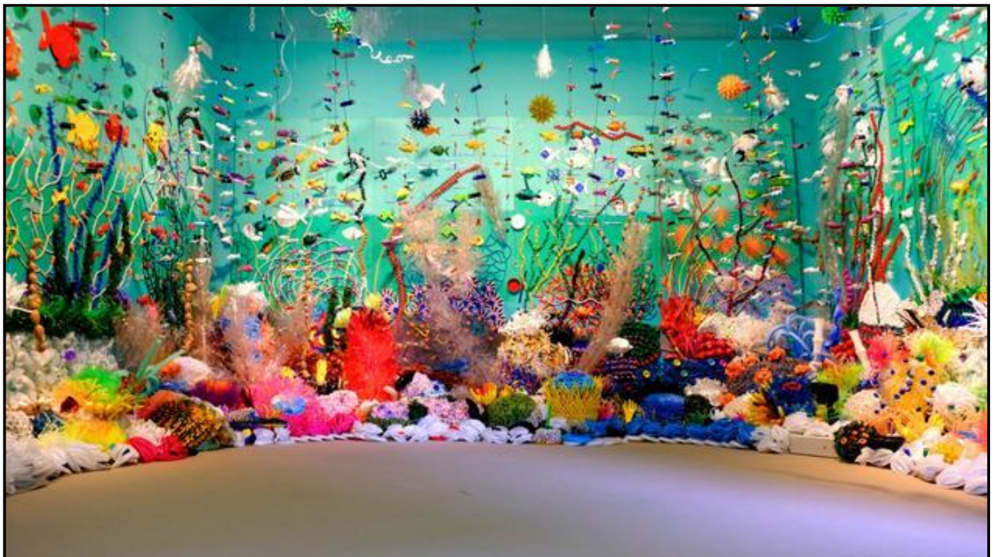
FIGURE 9: Federico Uribe's Personal Structures , 2019, was inspired by conservation and plastic pollution. Uribe has repurposed unusual objects and materials, such as bullet shells, coloured shoelaces, pins, pencils, electrical wires, ties and books to create a coral reef installation. From a distance the assemblages appear to be beautiful, colourful underwater worlds, reminding us of the fragility of life. Plastic production is unstoppable and according to the World Economic Forum, the world is now producing more than 300 million tons of plastic every year. Only 40 per cent is used once and more than 8 million tons of plastic are dumped into the ocean every year.