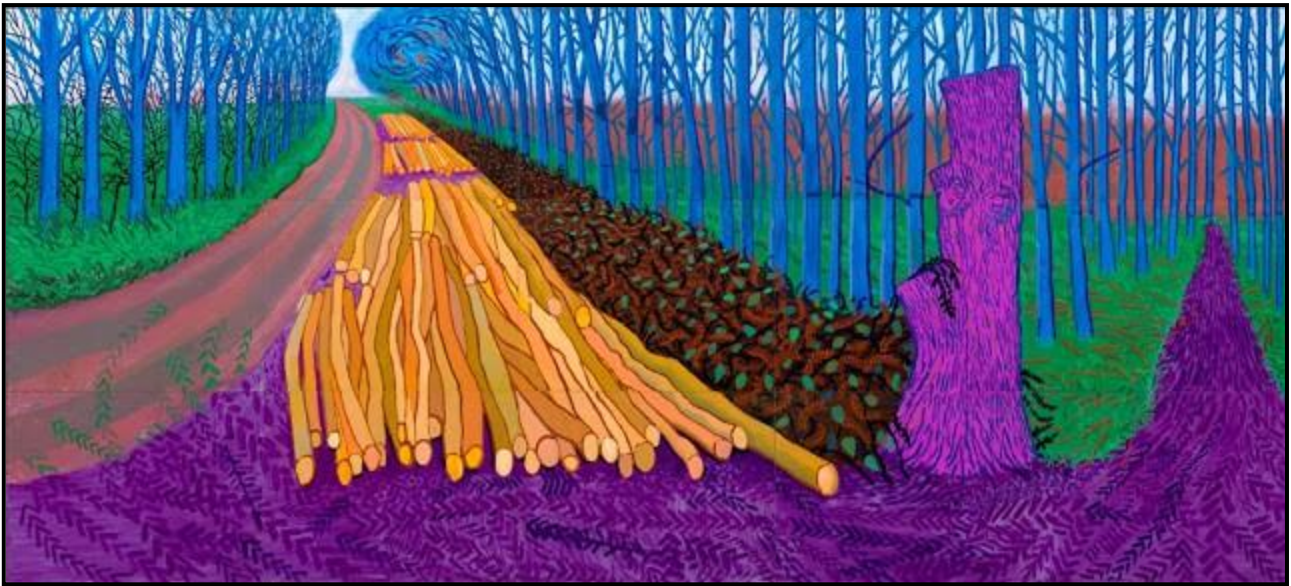
FIGURE 4: David Hockney, iPad Digital Artwork , 2020.