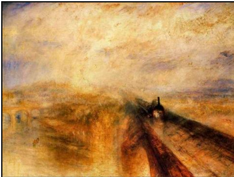
FIGURE 2: William Turner, Rain, Steam and Speed – The Great Western Railway , oil on canvas, 1844.

Over the centuries artists have been fascinated by depicting nature and landscapes.