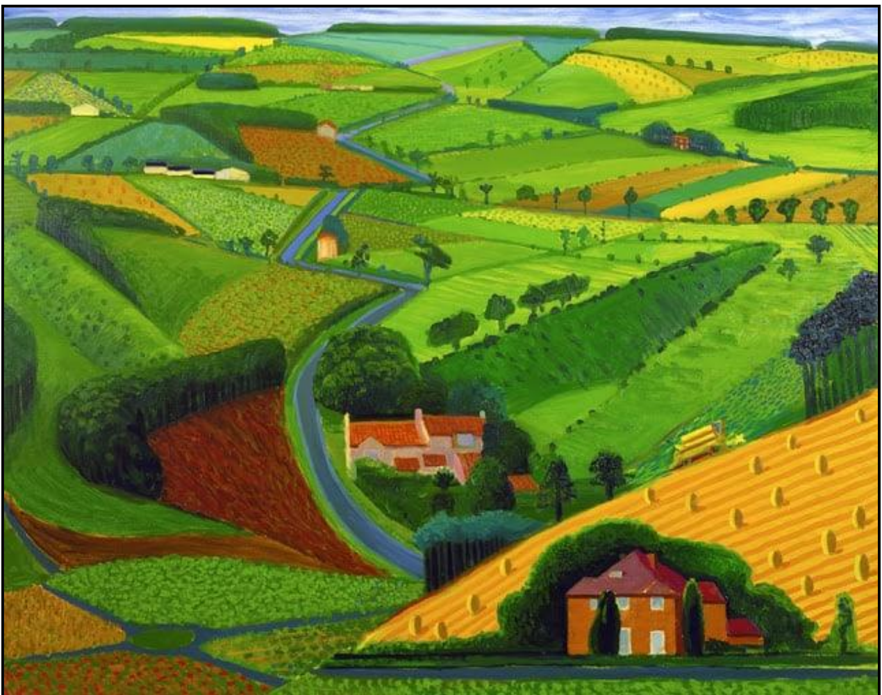
FIGURE 5: David Hockney, A Bigger Picture , iPad digital artwork, 2020. Hockney made numerous iPad drawings of the east Yorkshire landscapes en plein air showing the transition from winter to summer.