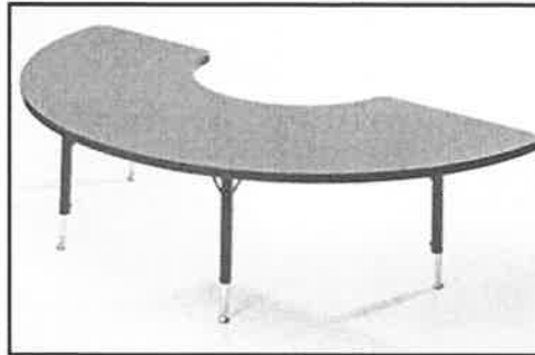
TABLE WITH A SEMICIRCULAR TOP

The information on how the semicircular tops are cut from the square piece of wood is in ANNEXURE B. The dimensions of the wood are 2,7 m × 2,7 m with a thickness of 38 mm.