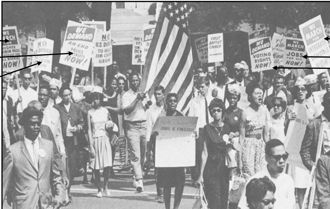
[From The Day They Marched by DE Saunders]

The photograph below is from a book titled The Day They Marched by DE Saunders. It shows civil rights marchers on the way to Washington, carrying placards during the March on Washington on 28 August 1963.