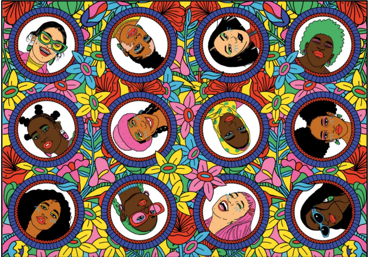
FIGURE A: Surface design by Zinhle Sithebe (South Africa), 2020.

1.1.1 Analyse the use of the following elements and principles in FIGURE A above: