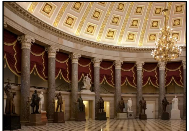
Detail of the United States Capitol interior.