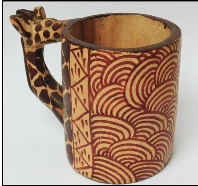
FIGURE D: Wooden Giraffe mug , designer unknown (Kenya), 2015.