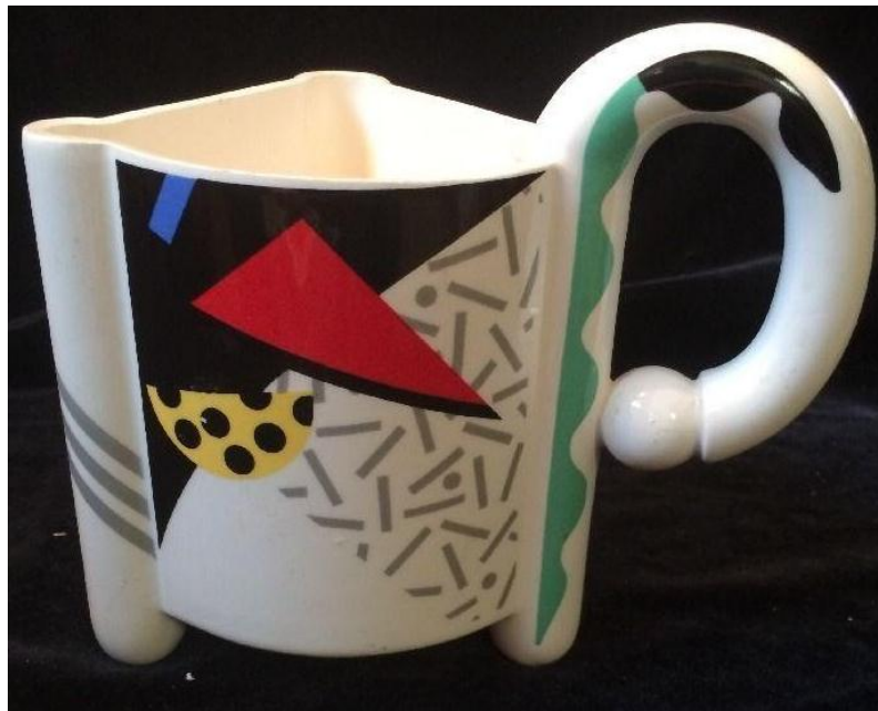
FIGURE E: Carnival mug by Fujimori for Kato Kogei Ceramics (Japan), 1980s.

Write a paragraph in which you compare the mug in FIGURE D with the mug in FIGURE E.