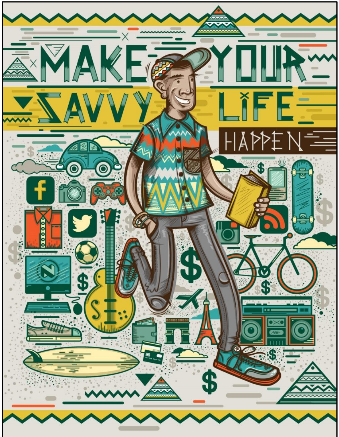
FIGURE C: Make Your Savvy (a wise, practical person) Life Happen poster by Wesley van Eeden (South Africa), 2020.

Identify and discuss TWO symbols used in FIGURE C above and explain their possible meanings in relation to the message of the poster.