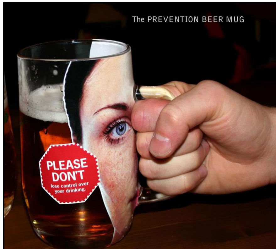
FIGURE J: Prevention Beer Mug Poster by EURORSCG Advertising Agency (Czech Republic), 2008.

5.1.1 Discuss how the message of the poster campaign in FIGURE J above is communicated by referring to the designer's use of layout and symbolism. (4)