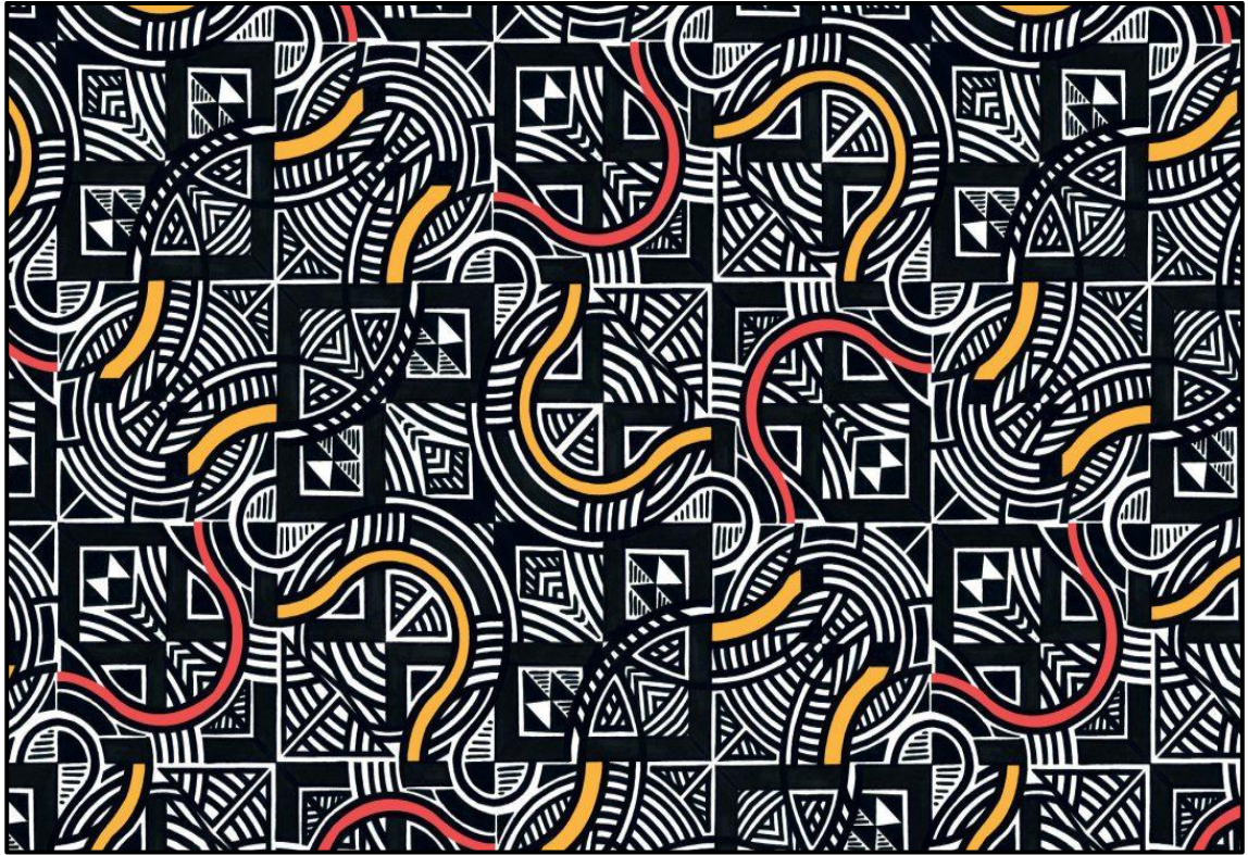
FIGURE B: Award-winning Pattern Design by Agrippa Mncedisi Hlophe (South Africa), 2019.

1.2.1 Analyse the use of the following elements and principles in FIGURE B above: