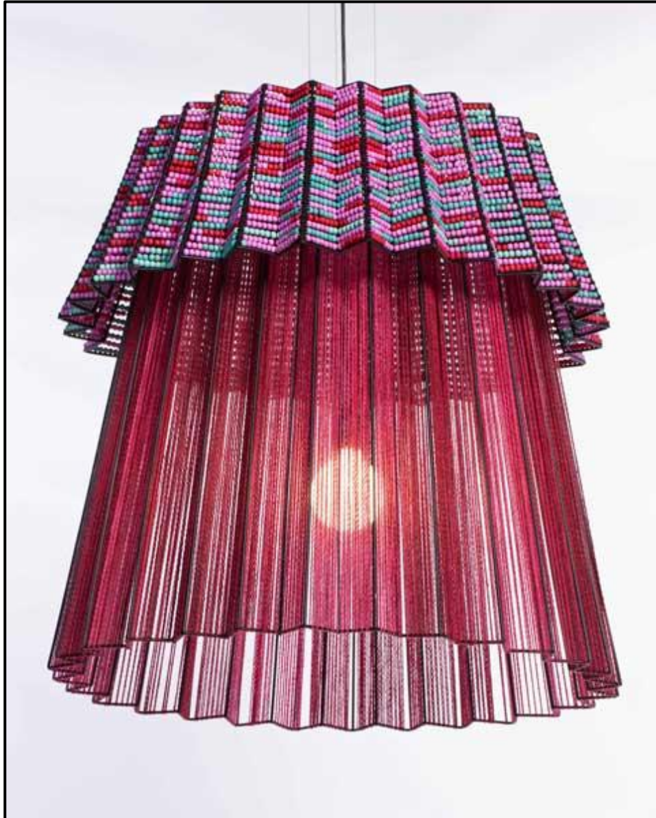
FIGURE A: Tutu 2.0 Pendant Light by Thabisa Mjo (South Africa), 2017.

1.1.1 Analyse the use of the following elements and principles in FIGURE A above: