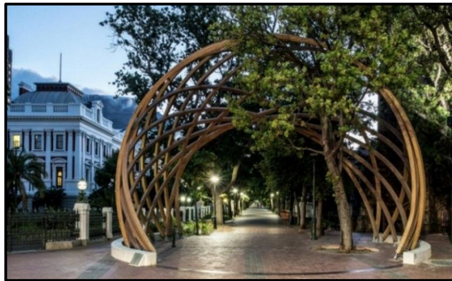
FIGURE G: #ArchForArch Commemorative Arch for Archbishop Desmond Tutu (South Africa), 2017.

Write an essay (at least ONE page) in which you compare the ancient Roman Arch in Volubilis, Morocco in FIGURE F with the contemporary #ArchForArch for Archbishop Tutu in FIGURE G.