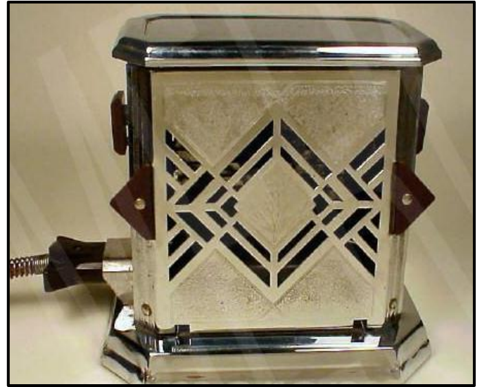
FIGURE I: Fostoria Toaster manufactured by Bersted MFG Co (Art Deco) (USA), 1930s.

Write an essay (at least ONE page) in which you compare the toaster in FIGURE H with the toaster in FIGURE I above. Explain how these toasters are typical of the movements they fall under.