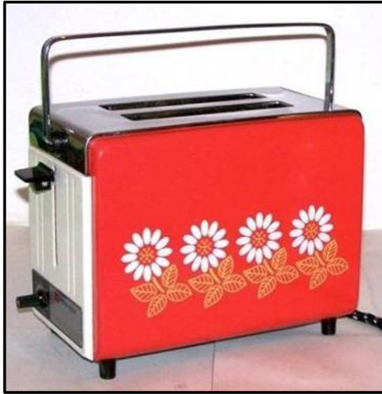
FIGURE H: Toshiba Toaster (Pop design) (Japan), 1960s.