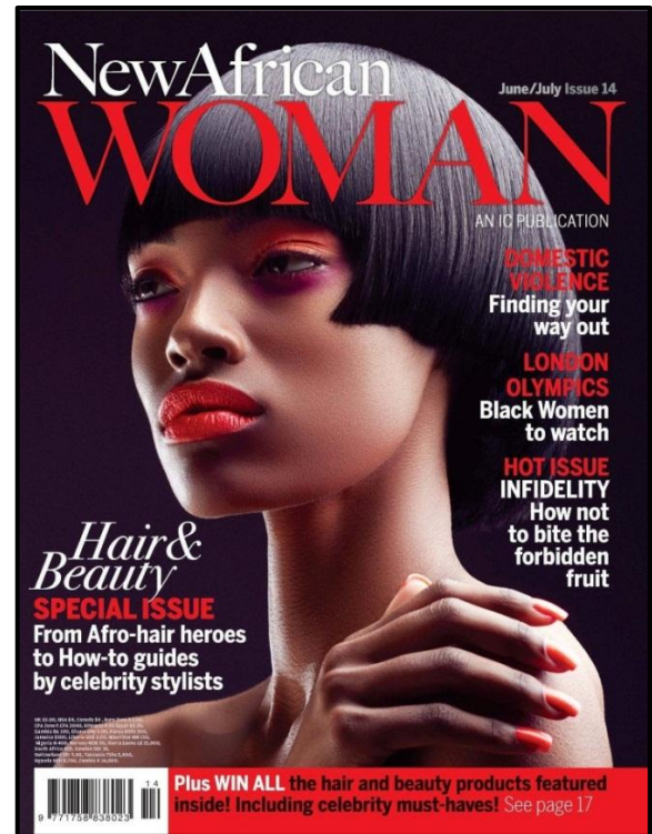
FIGURE E: New African Women Magazine Cover by IC Publications (London), 2014.

Compare the magazine cover in FIGURE D with the magazine cover in FIGURE E.