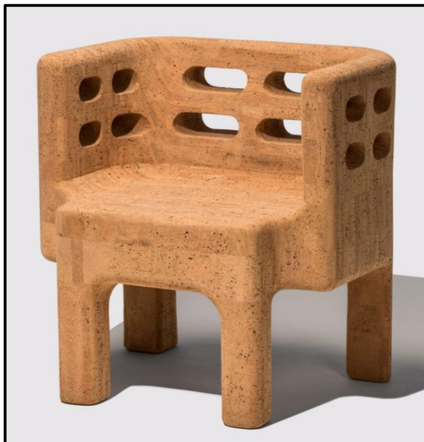
FIGURE L: Chair from the Sobreiro Collection by the Campana Brothers (Brazil), 2018. The chair is made of cork.

(Cork is a material that is derived from the bark of a cork oak tree. The bark is stripped from the tree, which is never cut down, to harvest the cork. Cork is environmentally friendly, waterproof and buoyant.)