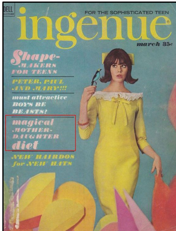
FIGURE D: Ingenue Magazine Cover by Dell Publishing Company (London), 1964.