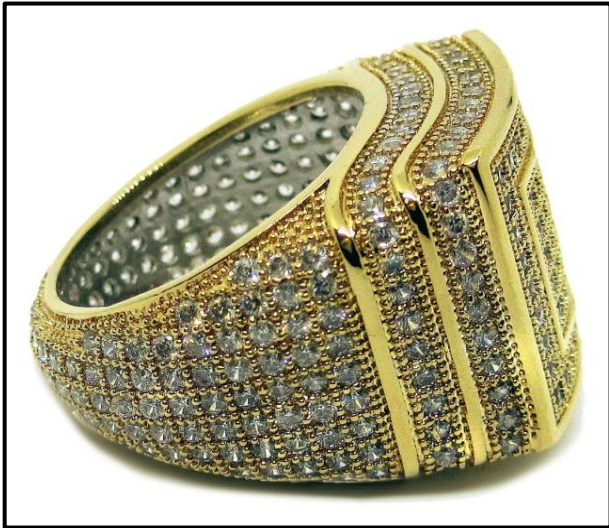
FIGURE E: Mega Chunky Men's Gold-plated Ring by Big Samy (USA), 2009.

3.1 Refer to FIGURE E and FIGURE F below and answer the question that follows.