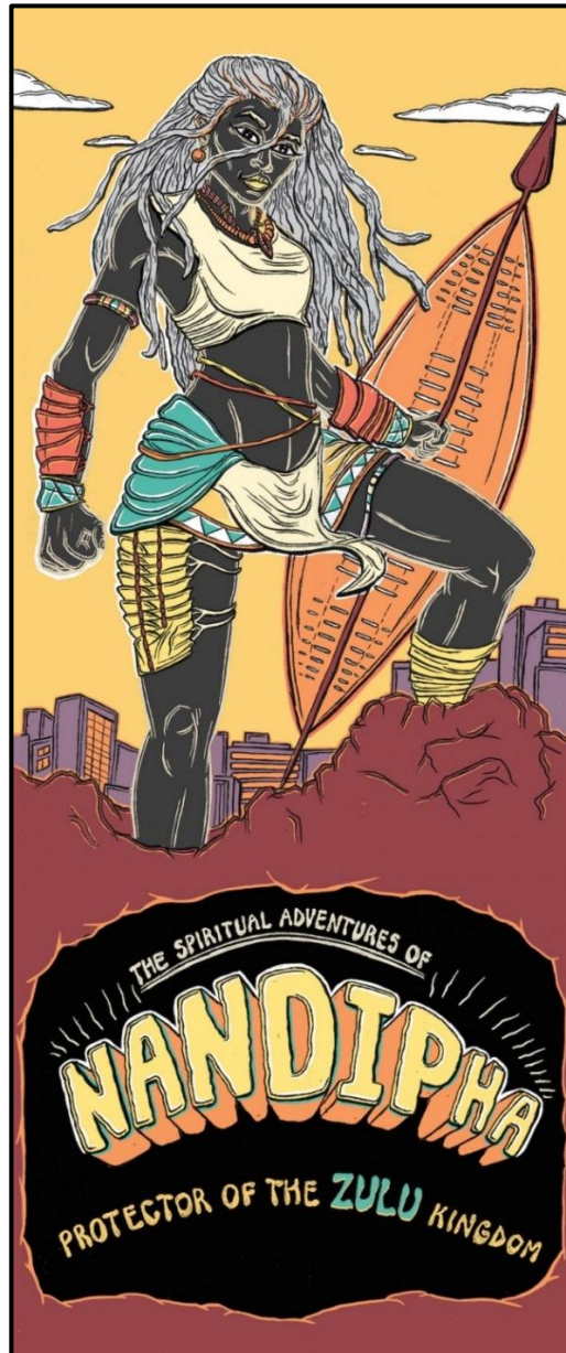
FIGURE A: Illustration for graphic novel, The Spiritual Adventures of Nandipha: Protector of the Zulu Kingdom by Zinhle Zulu (South Africa), 2018.

1.1.1 Analyse the use of the following elements and principle in FIGURE A above: