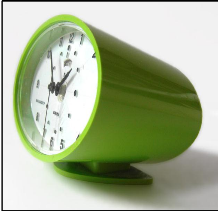
FIGURE I: Bellerup Calor (Pop design), (France), 1960s.