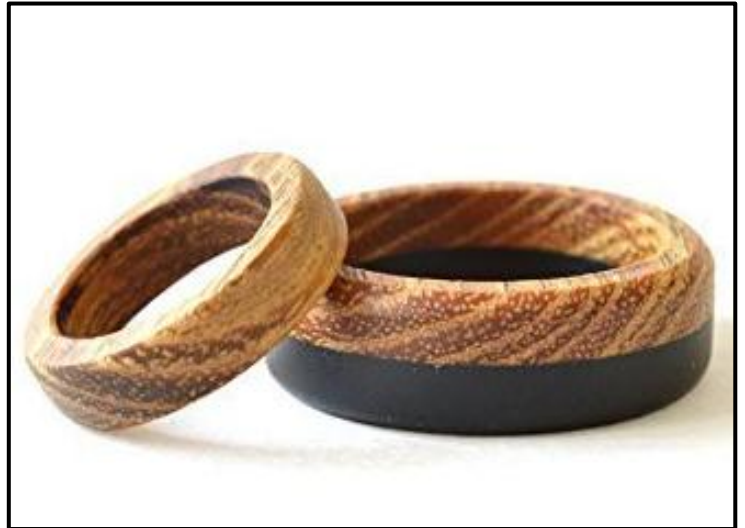
FIGURE F: Wooden Wedding Ring , designer unknown (South Africa), 2014.

Write an essay of at least 200–250 words (ONE page) in which you compare the ring in FIGURE E with the ring in FIGURE F.