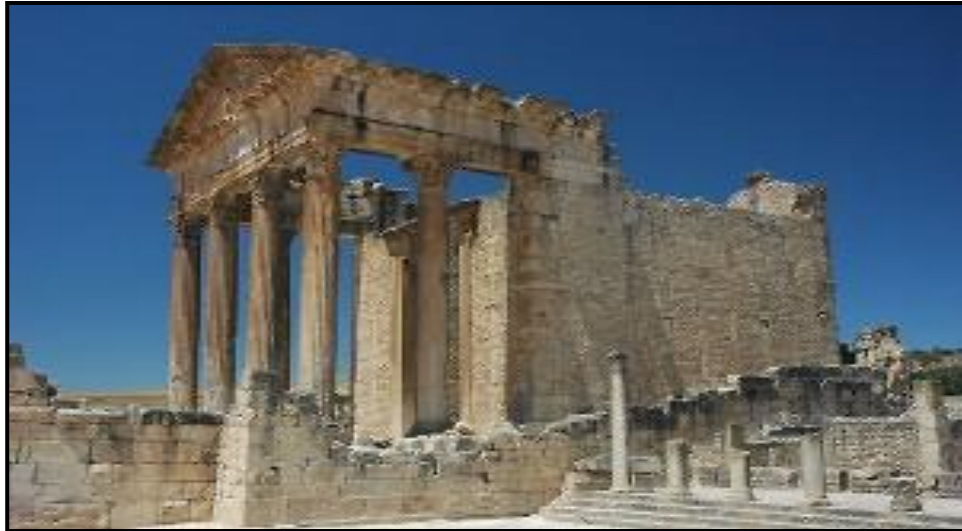
FIGURE G: The Capitol in Dougga, Tunisia (Africa), 166 ACE.