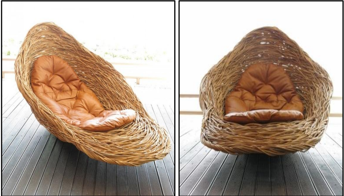
FIGURE L: Fallen Nest by Porky Hefer (South Africa), 2019.

5.2.1 Do you think the product in FIGURE L above is considered a design or a craft, or both? Give reasons for your answer. (2)