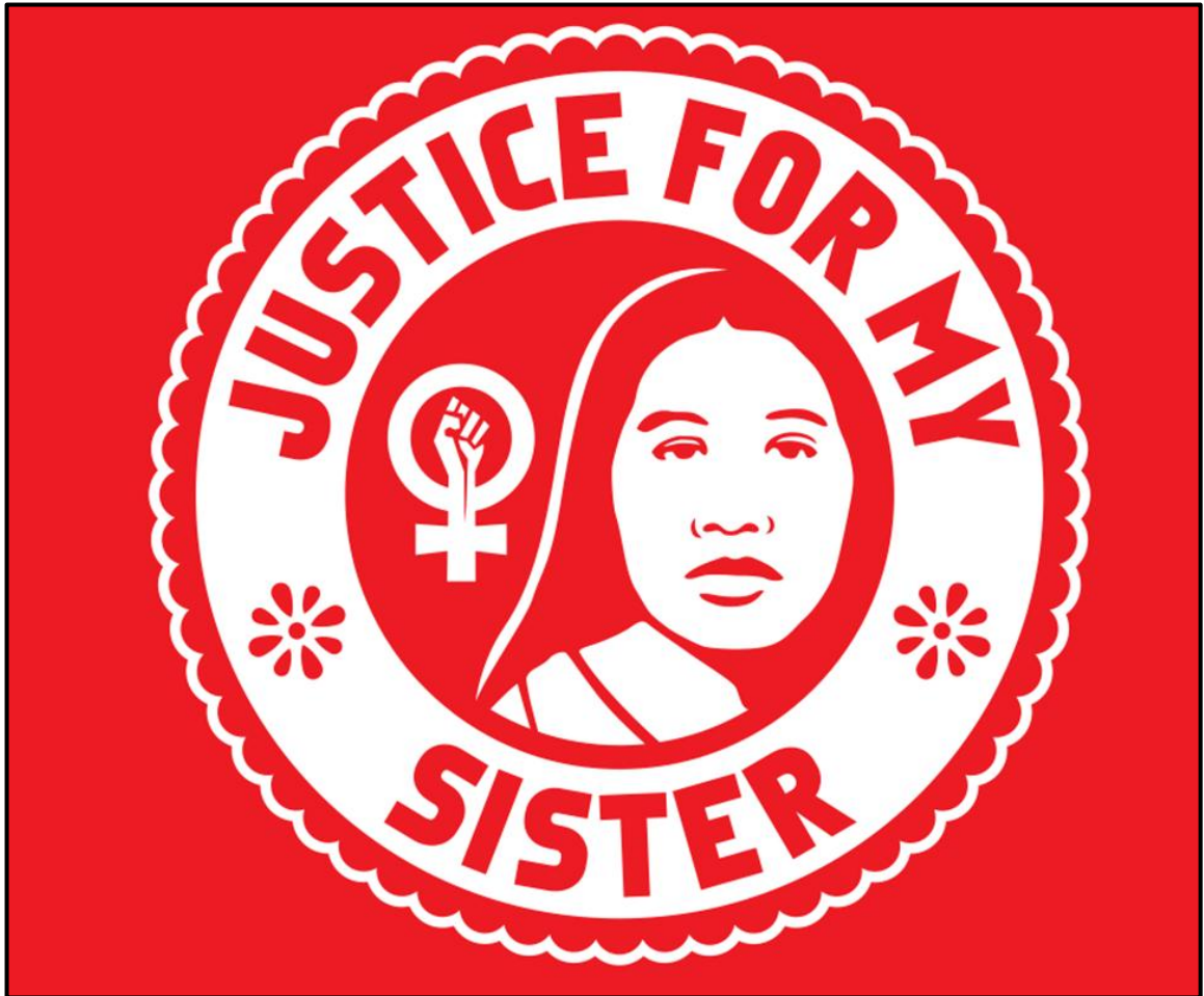
FIGURE C: Poster for Justice for my Sister Collective , designer unknown (USA), 2014.

Name THREE symbols evident in the design in FIGURE C above and discuss their possible meanings.