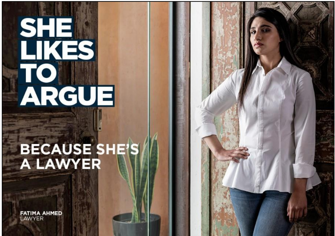
FIGURE D: PPS Women Acknowledged Campaign Poster , designer unknown (South Africa), 2018.

Discuss how the campaign poster in FIGURE D above uses wording and imagery to address the issue of stereotyping.