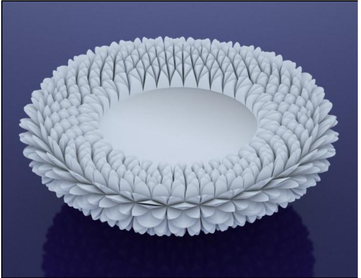
FIGURE B: Chrysanthemum Bowl by Michaela Janse van Vuuren (South Africa), 2009.

Layering and cutting of a type of nylon using a 3D printer.